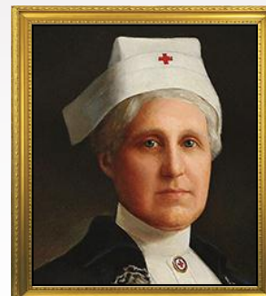
Miss Jane A. Delano 1909-1912