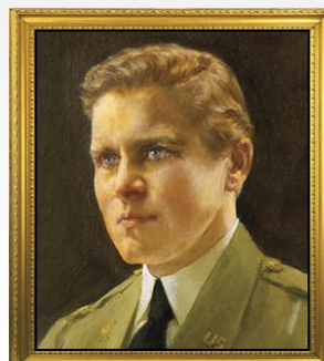
MAJ Julia C. Stimson 1919-1937