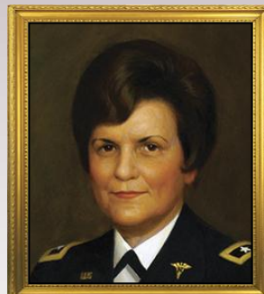
BG Anna Mae V. Hays 1967-1971